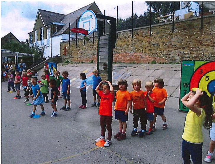
A younger year 6 in 2016, Sports Day at school

St Aidan's are hoping that next year there will be suitable weather for sports.